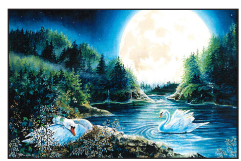
SWANS AT MOONLIGHT Anita Poland